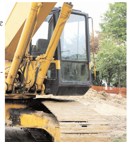
Young Windows uses ErgoLine benches to assemble windows for off-highway vehicles like this tractor.

Ironically, for a long time, the company's assembly department was being held back by immobility. This department is where aluminum frames and locks, glass subcomponents and the glass plates themselves are brought together to produce the final